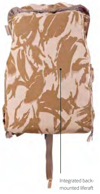
d back- Detachable mechanism