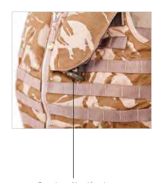
Operating pull hand/toggle